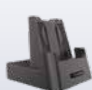
94A150095 Single Slot Charging Dock