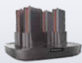
94ACC0192 4-slot Battery Charging Dock